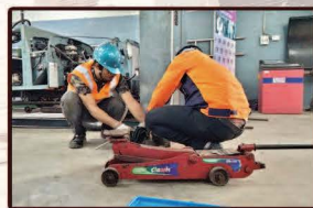
Work Skills Competition