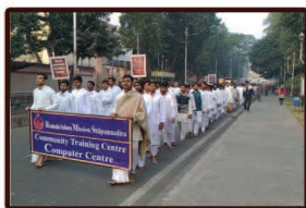
National Youth Day