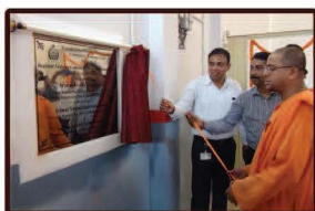
Mahindra & Mahindra RTC