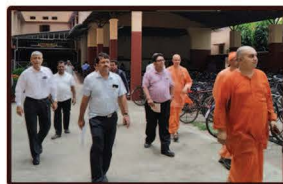
Visit of WBSCTVE & SD