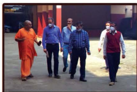
Visitors from Industry