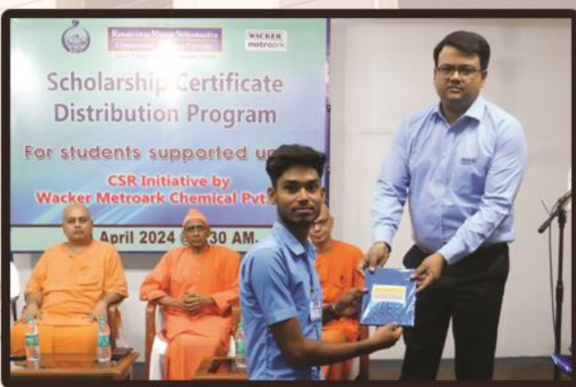
Technical kits Distribution