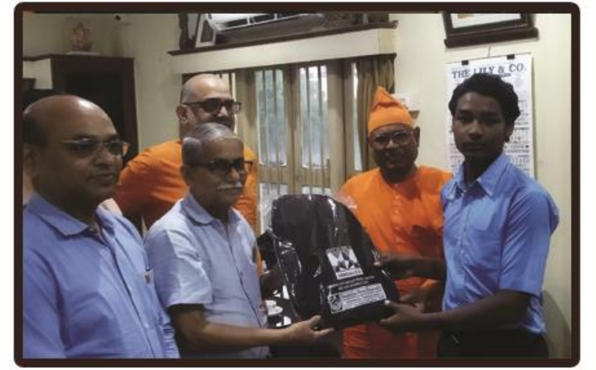
Student Bag Distribution