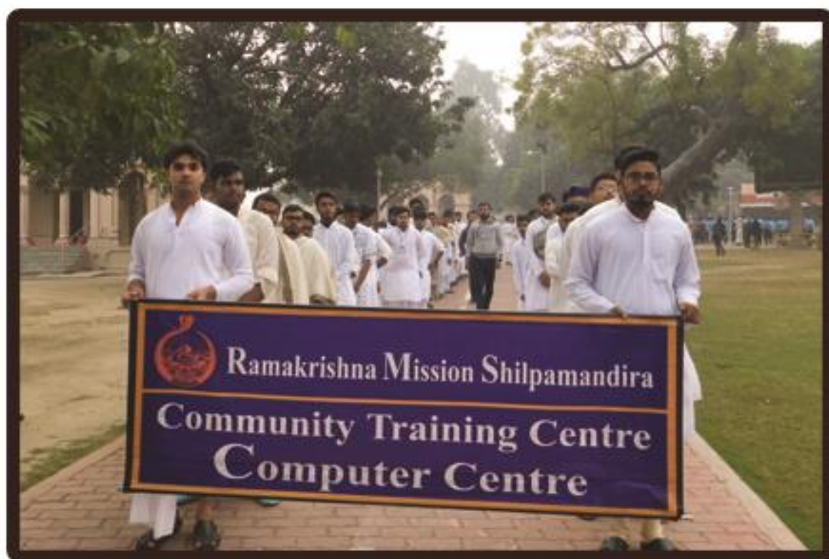
National Youth Day