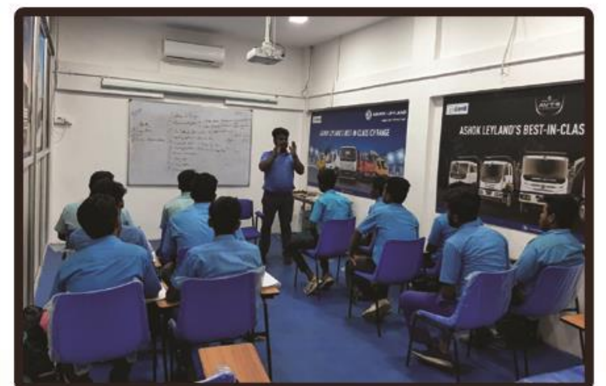
Ashok Leyland JSDC