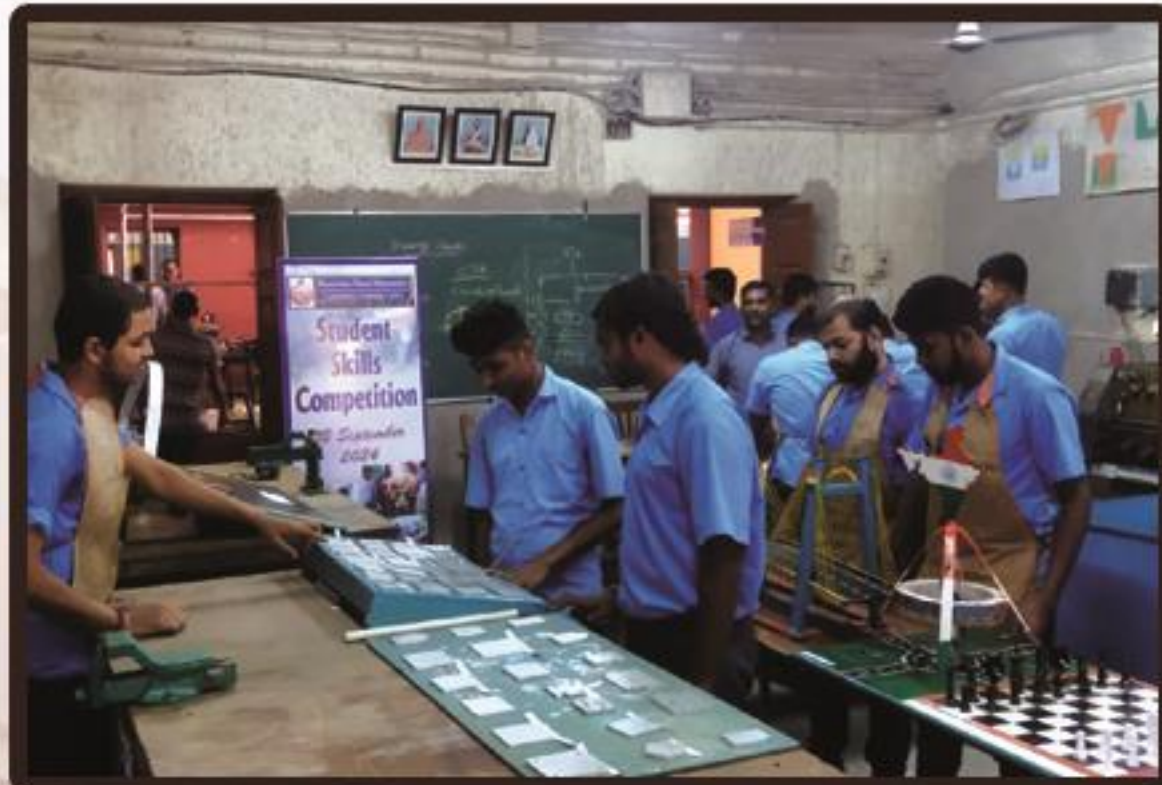
Student Skills Competition